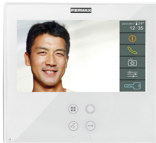
7" Smile Lynx monitor

Make your home a unique and stylish place where only you and your own enjoy the well-being and comfort you can manage from Smile; the technological heart of your home.